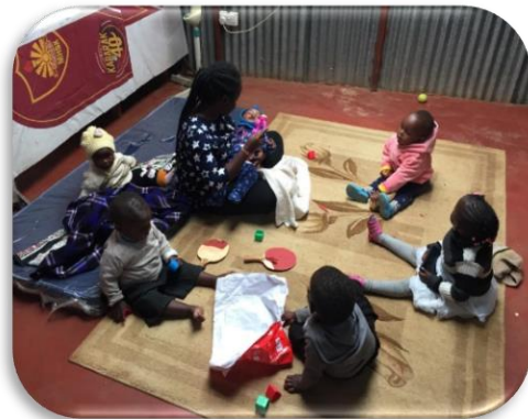
Children playing @ CAL Central Hub Ngong while their mothers/parents are attending CAL Classes