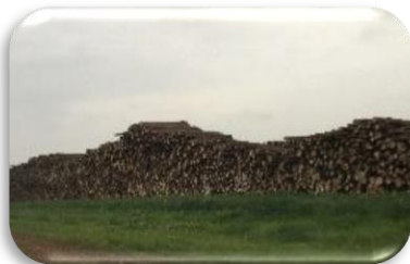
Stock 1 - Yard of lumber logs