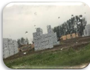
Stock 2 - Lumber packages ready for shipment