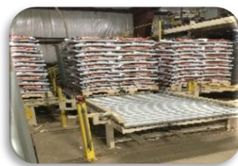
Stock 3 - Packaged wood pellets