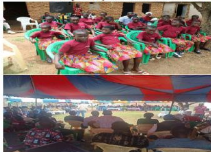
Students who were part of the launch and The Community members at the launch