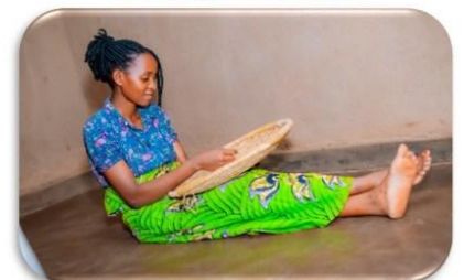
Facilitating handcrafts and enterprise business