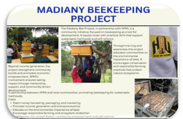
Beekeeping Startup: Enhancing Livelihoods and Environmental Stewardship