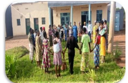
Facilitating Circle Sessions