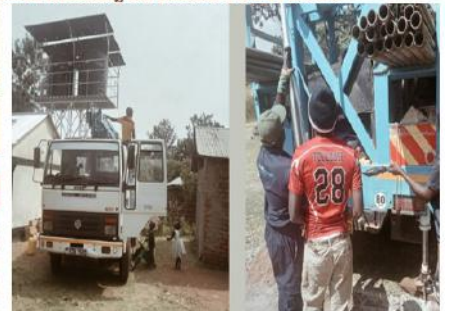
Solar powered borehole water-system being installed at the DECH Hub