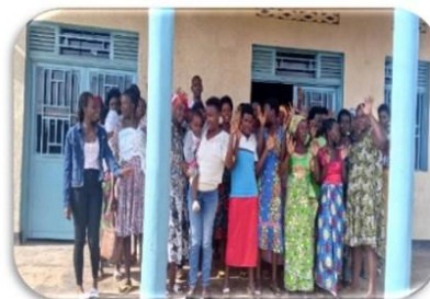
Meeting with single mothers at CHLM Office

We have adjusted the project timeline to accommodate the delay. Contingency planning is also underway to prevent budget overruns and maintain partner confidence while the issue is being resolved.