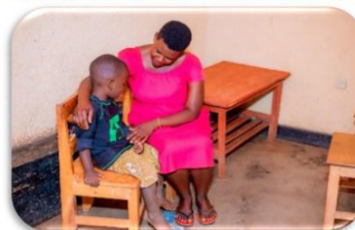
Visiting Single Mothers and their children