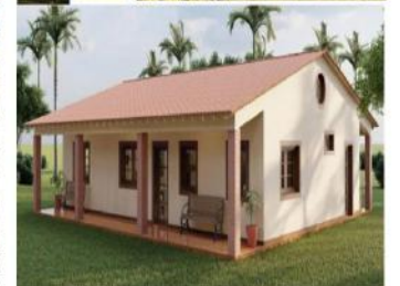
Photo: - Architectural Image of The Innovation Block under construction @ The Centre of Transformation