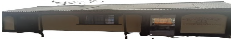
Photo: Newly built Lab with installed Solar Power System enabling The Hub to have a constant power supply and enhance security.

KMC – Migori East DECH Hub: This is KMC’s pioneer CAL Education Centre. In this period the program enrolled 120 students including 20 who were enrolled in TVET Skills. More than 60% of those enrolled graduated in June 2025 after a successful completion of their academic and vocational courses.