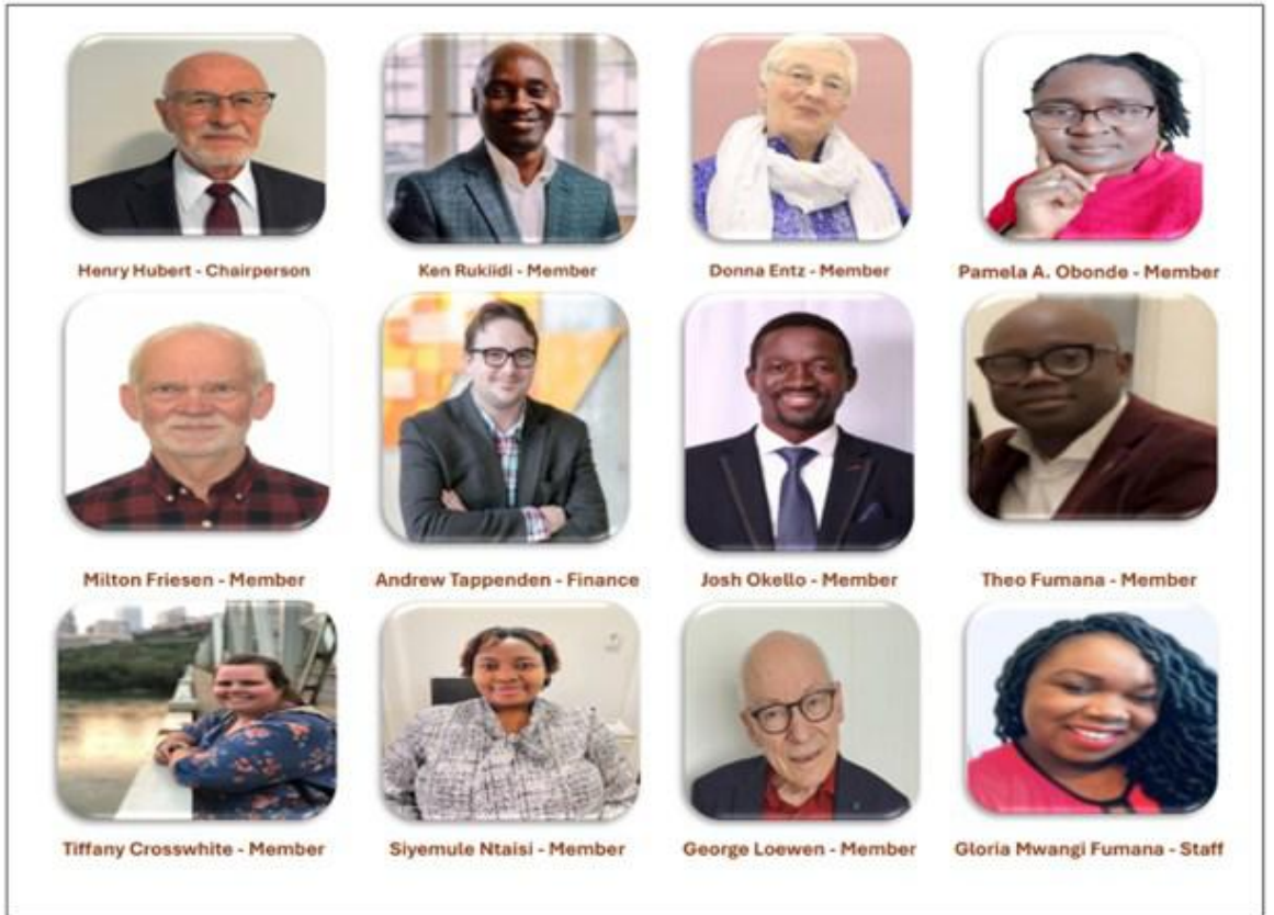
Picture 1 - CPI Leadership Team of diverse experience, professional knowldge and skills from across the Globe.

News Hubs - Tanzania Peace-Building Initiative and more .... [Read More on page 6-7]