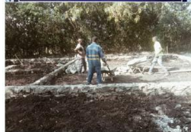
Photo: - The Hubs highlighting the accessible 4-in-1 CAL Education School Levels @ APMI - COT -The buildings foundational work in progress