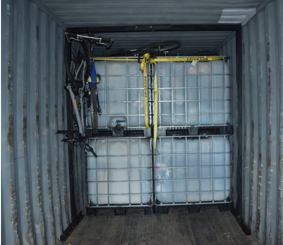
Cubes containing computers stacked in the sea can.