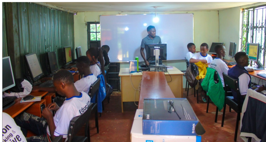
Computer instruction in the APMI school in Ngong.

The first school was opened in Ngong, a suburb of Nairobi in 2022. Currently, it offers introductory computer classes and vocational training in tailoring, hairdressing, and barbering. An academic CAL program will commence when APMI receives accreditation from the Kenyan government.