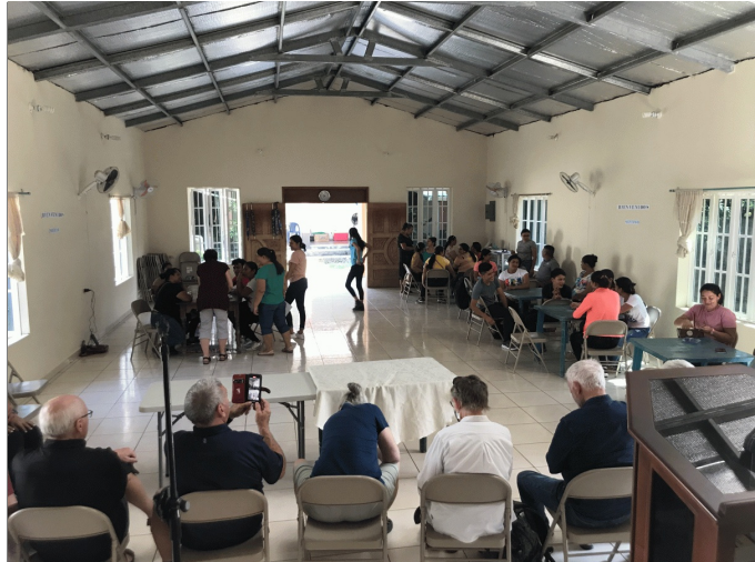
The church in San Antonio del Norte that is being used for the new CAL school in the community.

In November, 2022, members of CPI's Working Tour to Honduras made presentations about the benefits of CAL to the pastors of churches in the remote mountain villages of San Antonio del Norte and Guajiquiro, close to the border with El Salvador (see Newsletter, December 2022). The pastors were keenly interested in the program and offered to house the schools in their churches. As a result, schools were opened in both communities on February 1, with enrolments of 32 and 6 students in San Antonio and Guajiquiro, respectively.