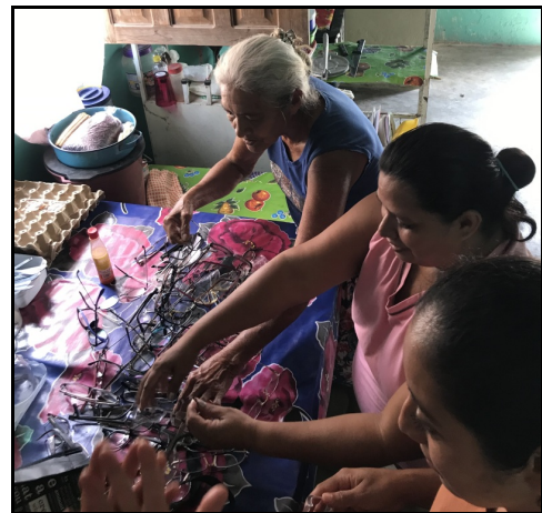
Women in Tapiquiales selecting eyeglasses.

Unlike what was done on previous Learning Tours, this group did not take any computer supplies with them. However, they did bring several hundred pairs of eyeglasses collected at the MCC Thrift Shop in Edmonton. The glasses were distributed to those could not afford to buy their own in the village of Tapiquiales and at other locations.