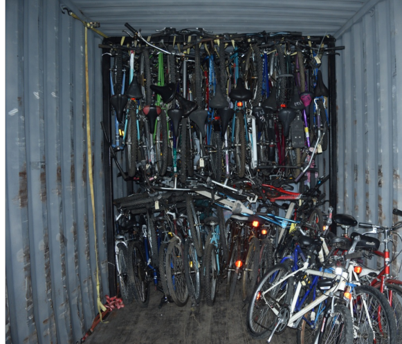
Bicycles packed on the floor and hung from the roof of the container.