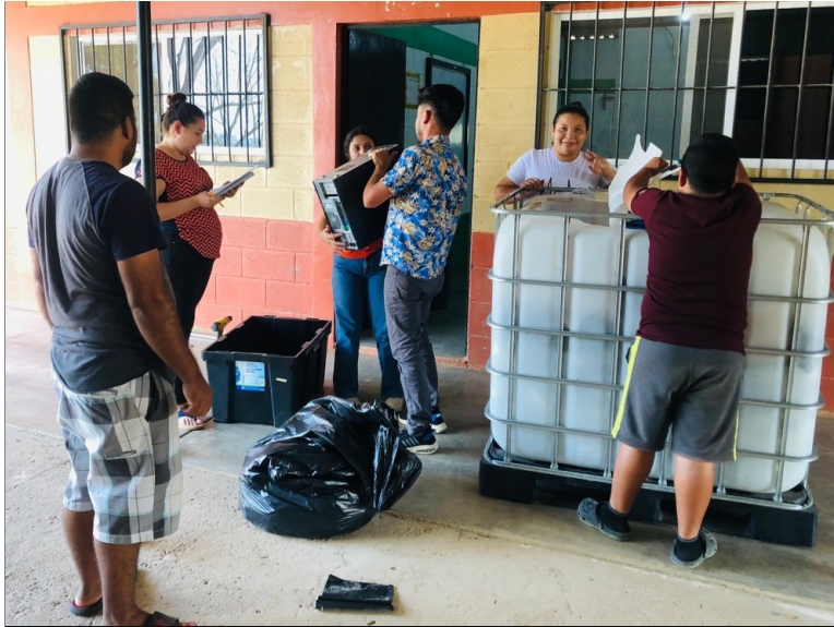
Staff at the school in Santa Cruz de Yojoa unpacking the cube shipped from Edmonton.

A much larger shipment that has been in preparation for several years is almost ready. A 40-ft. sea can has been purchased and is being loaded with assorted, donated equipment. Nineteen cubes have been filled with 500 computers, and 70 bicycles have been serviced to ensure they are in working order. An appeal for sewing machines in The Country Register (Alberta) , a bimonthly publication aimed at the quilting and sewing community, was instrumental in CPI obtaining donations of more than one hundred sewing machines from around the province. Over half of these have been serviced already and when the remainder are done, they will all be packed in cubes as well. In addition, a large assortment of tools that has been accumulated for a mechanical vocational program is being sent. The sea can will also contain two cubes filled with equipment needed by Lead with Seeds, another Edmonton-based organization that is active in Honduras.